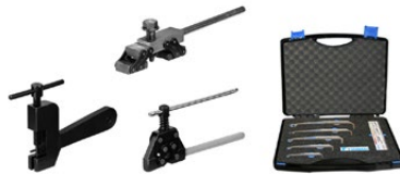
ROLLER CHAIN TOOLS