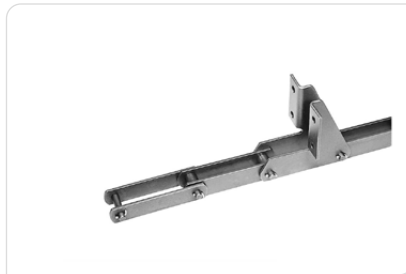
ATTACHMENT ROLLER CHAINS