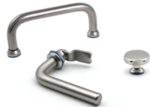
HANDLES & TURN LATCHES