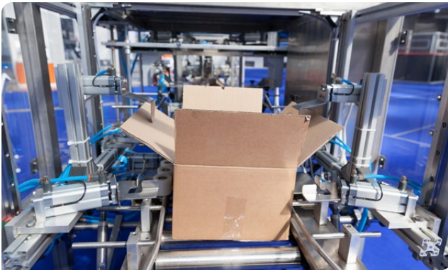
UNIT LOAD CONVEYORS