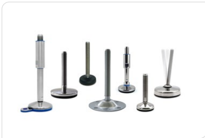
STAINLESS STEEL FEET

certified machine feet, you can be sure that they meet the strict hygiene requirements in the food and pharmaceutical industries. With customized accessories - for example, hygienic pressure load cells or threaded covers - we offer you the right solution for every task.