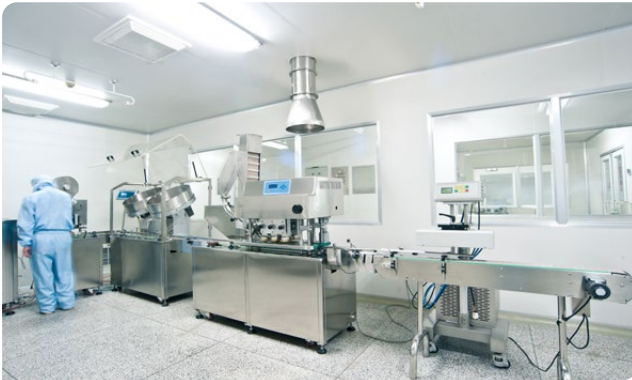
HYGIENIC AND FOOD TECHNOLOGY

Our products are universally applicable. In our experience, thanks to the specific properties, our components have proven themselves especially for the following industries: