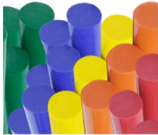
POM ROUND RODS FOOD-SAFE

signs and the sealing of moving parts, we offer you solutions specially tailored to the needs of the most hygienically demanding environments - for hygiene down to the smallest screw. Uncompromising premium quality meets intelligent design: You too can put your trust in machine elements from Movet!