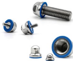
NUTS & BOLTS