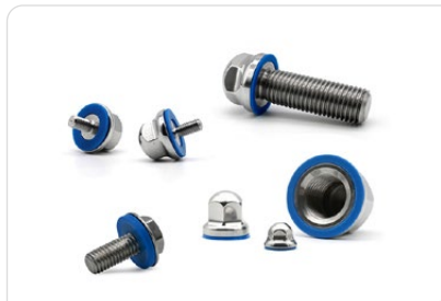
NUTS & BOLTS