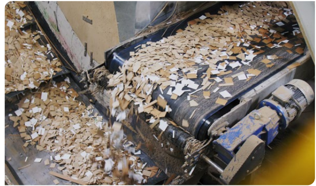
BULK SOLIDS TECHNOLOGY