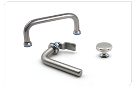
HANDLES & TURN LATCHES