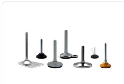
STEEL LEVELLING FEET