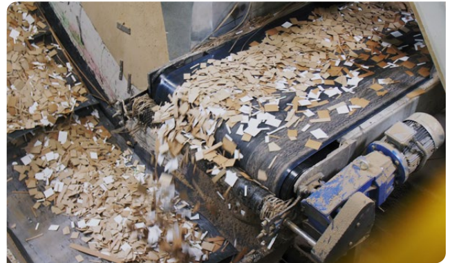
BULK SOLIDS TECHNOLOGY